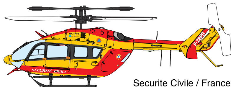
Securite Civile / France

SG brushless tail motor used. Direct motor can run more smoothly without power loss.