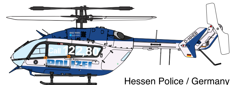
Hessen Police / Germany